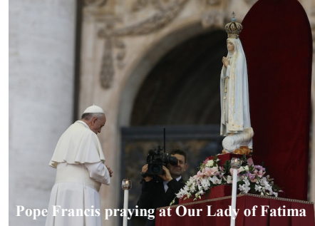
Pope Francis praying at Our Lady of Fatima